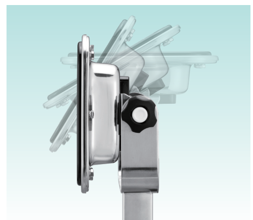
Freely adjustable display angle