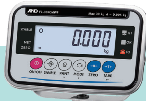
M-size platform (30 kg)