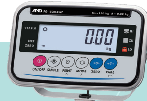
L-size platform (60 kg / 150 kg)