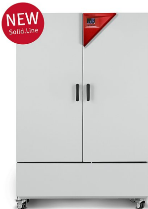
Model KBF-S 720